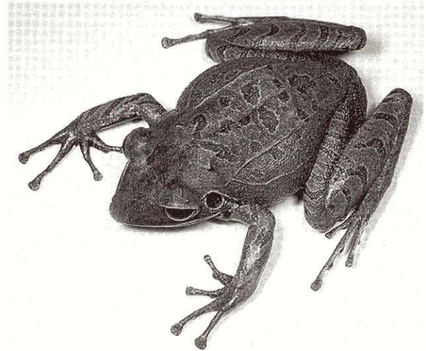
Figure 1. An adult male Eleutherodactylus parapelates (USNM 257727) from the type locality.

Dorsal ground color is dark to light brown with irregular dark spots forming a more or less bilaterally symmetrical pattern. Many dorsal markings are narrowly outlined in white or buff. Supratympanic and dorsolateral folds are usually light, and distinctive black stripes occur below the supratympanic fold. Dark