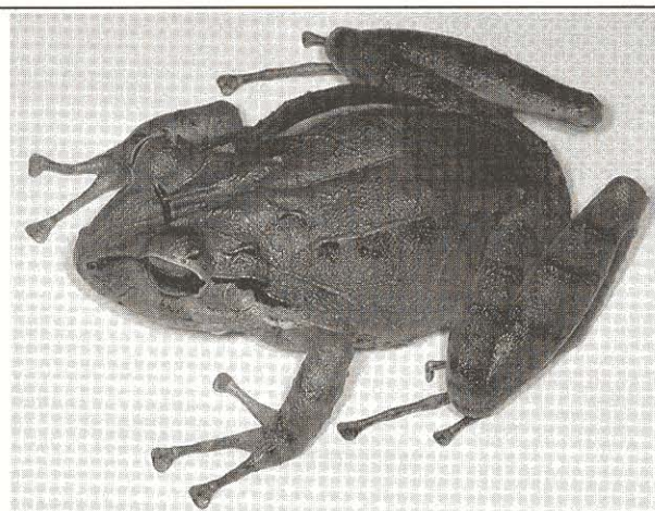
Figure 1. An adult female Eleutherodactylus chlorophenax (USNM 257730) from limestone hills in the vicinity of Plain Formon, 1,000 m.

• Pertinent Literature. Schwartz (1976) described the species and assigned it to the inoptatus group, an assignment with which Hedges and Thomas (1987) and Joglar (1989) agreed. Based on molecular and some morphological data, Hedges (1989)