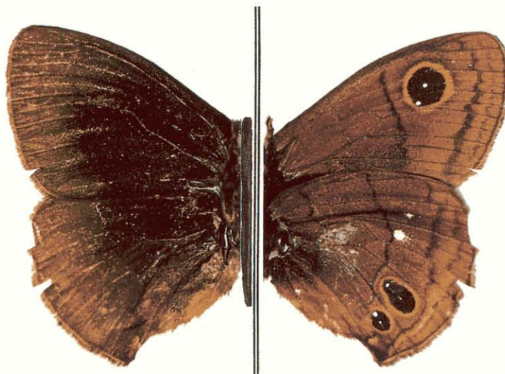
Fig. 1. Upper surface (left) and under surface (right), Calisto tasajera male, Valle de Bao (1800 m), north slope of Pico Duarte, Santiago Province, Dominican Republic.

Gonzalez, Schwartz and Wetherbee (1991) described C. tasajera from a series of specimens from San Juan Province, Dominican Republic, taken on Loma de Tasajera in fire-charred grassland at 2141m. They also reported the species from the base of Loma la Diferencia, 1750-2300m on the border with Santiago Province and from Santiago Province on Pico Platico, 1200-2500m. These localities are not accessible by vehicular traffic. Specimens reported in the present paper were obtained while the