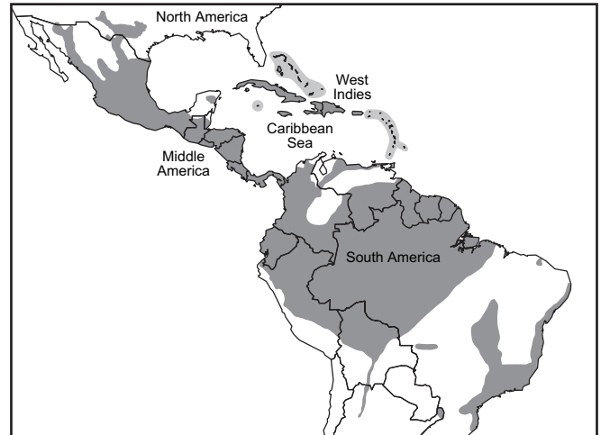
Fig. 1. Composite distribution of eleutherodactyline frogs and Brachycephalus (812 sp.). "Middle America" refers to Central America and Mexico. No evolutionary groupings are implied.

Terrestrial breeding and direct development have allowed eleutherodactyline frogs to occupy a diversity of ecological niches and have facilitated their wide distribution (Fig. 1). Eleutherodactylines occur on almost every island in the Caribbean and display near total endemism to single-island banks. Their elevational range also is broad, with some species occurring up to 4,400 m in the Andes of South America. Thus, they are a model group for studying Neotropical biogeography and evolution. With this in mind, we assembled samples and available sequences of 276 species of eleutherodactylines and Brachycephalus for several mitochondrial and nuclear genes. Our goal was to identify the major groups of species and their times of divergence, to better understand the historical biogeography of eleutherodactyline frogs and the region in general. Our results revealed several major and, for the most part, geographically isolated, clades of eleutherodactyline frogs and showed that the